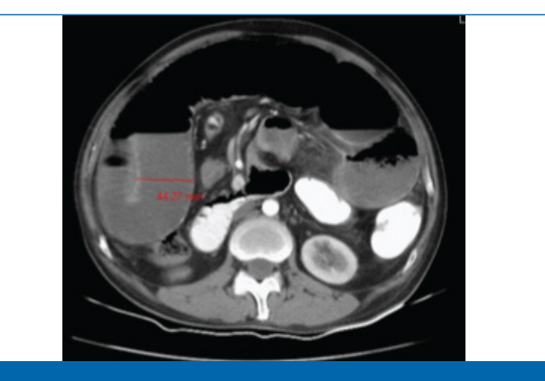
[Table/Fig-12]: Intestinal obstruction case: CECT abdomen and pelvis showing dilated small bowel loops due to narrowing at ileum.