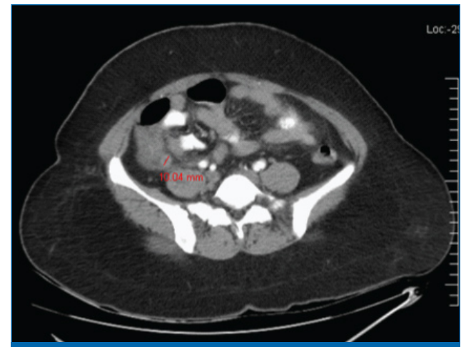
[Table/Fig-10]: Acute Appendicitis case: CECT Abdomen and Pelvic study showing inflamed appendix.

20%), Meckel's Diverticulitis (n=1, 2%), periceacal abscess (n=1, 2%), intussusception (n=1, 2%) and sub diaphragmatic abscess (n=1, 2%) [Table/Fig-14].