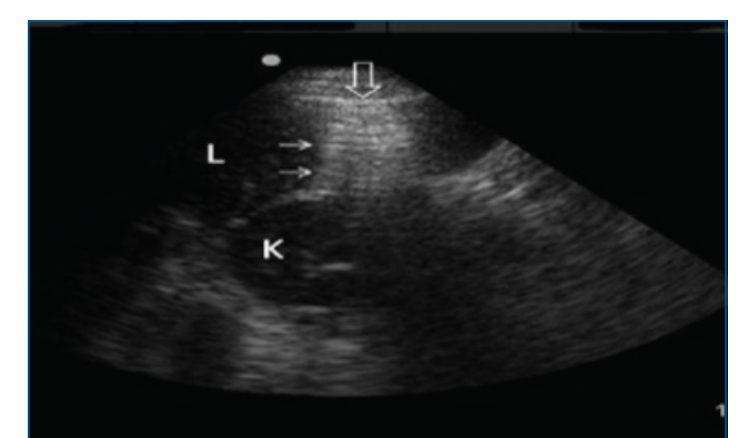
[Table/Fig-8]: Hallow viscus per perforation case: Ultrasound image <u>showing reverbe</u>ration artifacts s/o pneumoperitoneum.