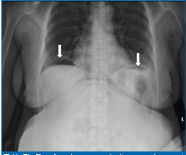
[Table/Fig-5]: Hallow viscus per perforation case: X ray erect abdomen showing Air under dome of diaphragm.

Ultrasound findings were suggestive of acute appendicitis (n=22, 44%) [Table/Fig-7], hollow viscous perforation (n=11, 22%) [Table/